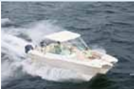
Arriving in October for rescue and training in deep or shallow waters

After two years of restructuring, the "Year of 13-04" is now unfolding. An exciting, super-fast, twenty-nine foot, dual console, twin hull vessel equipped with twin 300HP out-board engines that is "Keys-Perfect" for training and rescue will be delivered mid-October to replace our previous, inadequate, patrol-rescue vessel. Confident in our choice of a stronger on-the-water program, we have also used these years to change the historically distant relationship with our sister Flotilla in Key Largo and infrequent assistance to and from the USCG in Islamorada. We have built a vital three-area working team that our new vessel and eager, new members can support. Thanks OR Community Foundation, impossible without you!