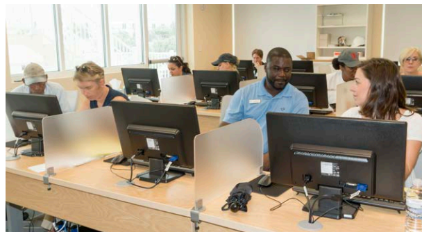
Assistance for Associates provided by ORCF.