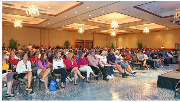
First ever Associate Town Hall meeting.

When photos taken immediately following the storm were shown there were gasps, and then when the progress photos came up, there were oohs and aahs, and hope was breathed back into the room. The most incredible message to this room full of Associates was that their Club's Members cared for them. Evidenced by the Board's decision to continue paying all Associates while the Club is closed, evidenced by the hundreds of emails and calls of support from the Membership, and evidenced