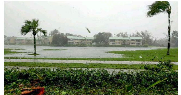
Dolphin Fairway #10 immediately following Irma.