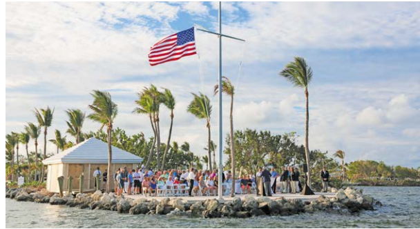
Flag raising at The Point.