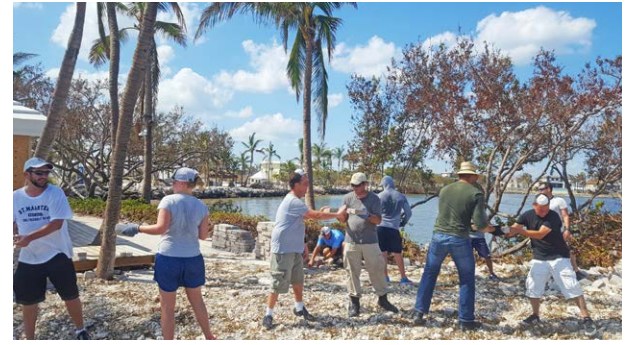
Associates cleaning up on Buccaneer Island.