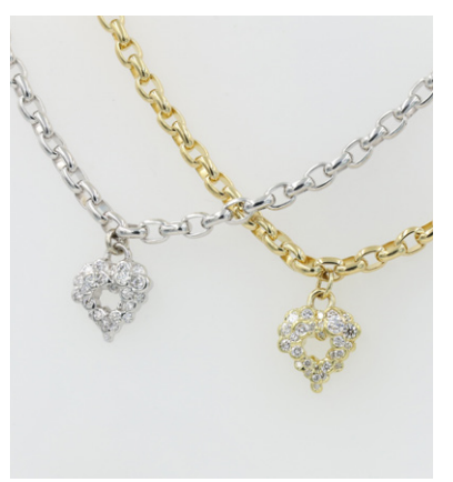
"Heart of Ocean Reef" custom-made Lester Lampert bracelet.

Come taste the wine (and bourbon): Check on your dream list items during the $50 Opening Night Wine & Bourbon Tasting & Silent Auction 4 to 7 p.m. Friday, Feb. 2, at Carysfort Hall. Or if Friday night isn't an option, or you can't get to everything, return between 11 a.m. and 5 p.m. Saturday, and enjoy complimentary "Burgers, Beers and Bidding" from noon