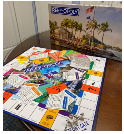
Custom-made REEF-opoly game tailored to Ocean Reef.

©2024 NetJets IP, LLC. All rights reserved. 3-0003