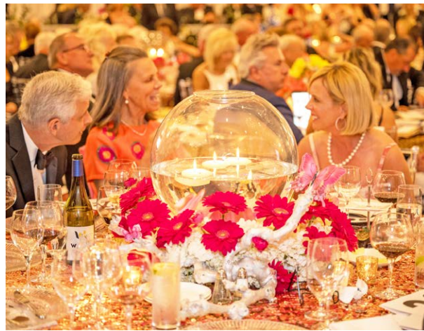
Beautiful décor set the stage for a stunning evening.